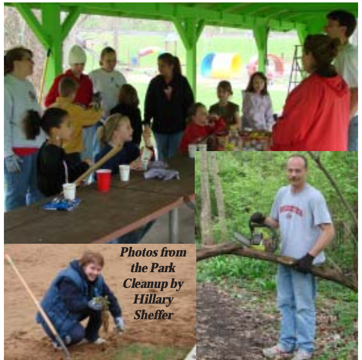
Photos from the Park Cleanup