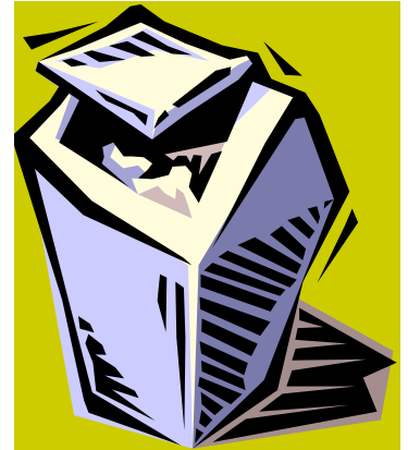
Put your junk in a trunk!

2. The storage or keeping of trash or refuse, regardless of its location on the property, for a period exceeding 30 days shall be prohibited, unless further restricted by the municipal code.