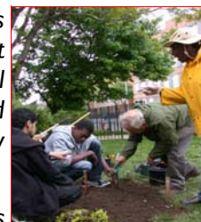
Teaching & Planting