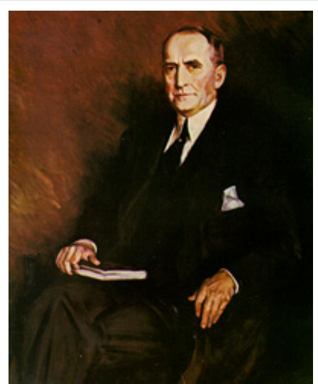
Painting of Bankhead as House Speaker.

The William B. Bankhead National Forest and sections of old US Highway 78 in northern Alabama are named in his honor. His home in Jasper has been renovated to house the Walker Area Community Foundation's "Bankhead House and Heritage Center", a history museum and arts venue.