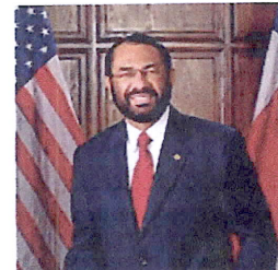
View Welcome Message video

[RealVideo; choose your connection speed: 56k , 256k , 384k ; download a player ]