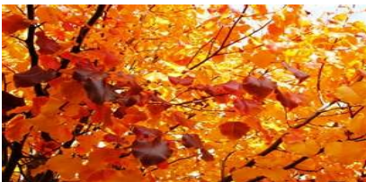
Picture of November Trees