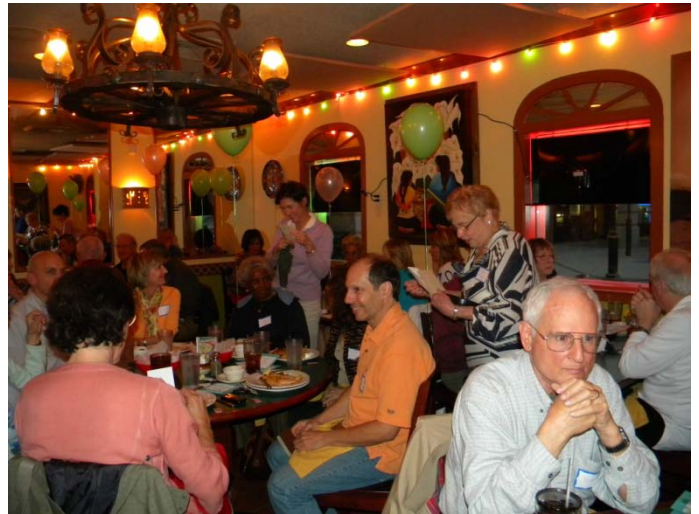
Volunteers listen as Rae thanks them for their work.