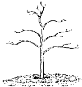
Mulch properly applied

For more information, see the complete article, Mulching for a Healthy Landscape , at: http://pubs.ext.vt.edu/426/426-724/426-724.html