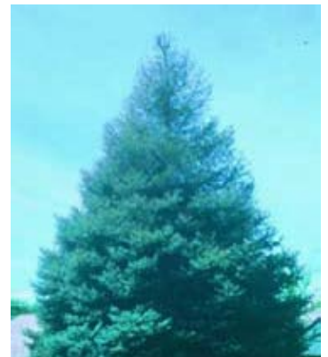
Damage to a Douglas-fir from Douglas-fir tussock moth. Larvae begin feeding at the top of the tree at about the time of bud break and defoliate the tree from the top down.