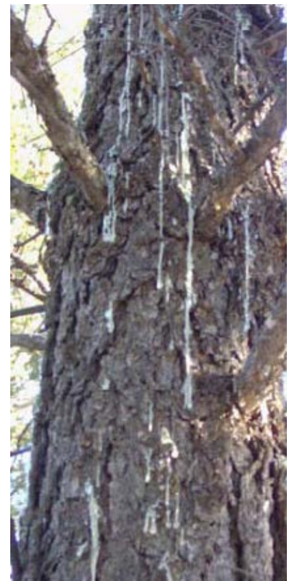
Pitch streamers on the bark of a beetle-infested Douglas-fir. Not all infested trees will exhibit pitch. Trees should be checked for boring dust in the early fall.

Unlike MPB-infested trees, Douglas-fir trees do not form pitch tubes when attacked, so there may not be an obvious visual indication of infestation. Some Douglas-fir bleed sap when attacked, resulting in rivulets of sapon on the trunk; however, this does not occur in all infested trees. Trees should be checked carefully for boring dust in early October. Later in the year, woodpecker holes may provide a visual clue that trees are infested.