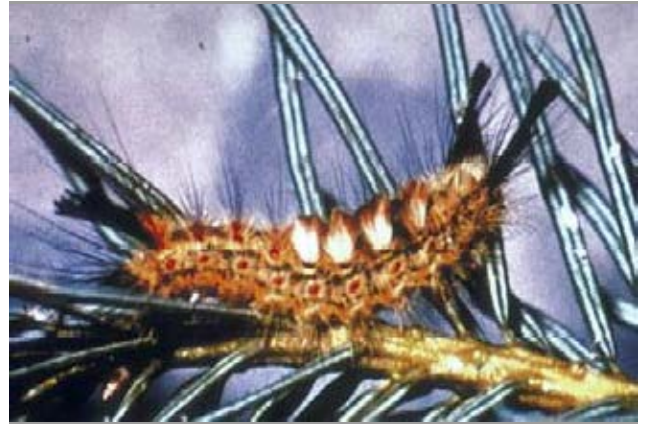
Douglas-fir tussock moth caterpillar. The name "tussock moth" comes from the four tufts of hair on the caterpillar's back.

Douglas-fir tussock moths are best managed by maintaining healthy, diverse forest stands. Forest stands composed of mixtures of ponderosa pine and aspen tend to be resistant to tussock moth outbreaks and offer greater wildfire resistance than pure stands of Douglas-fir.