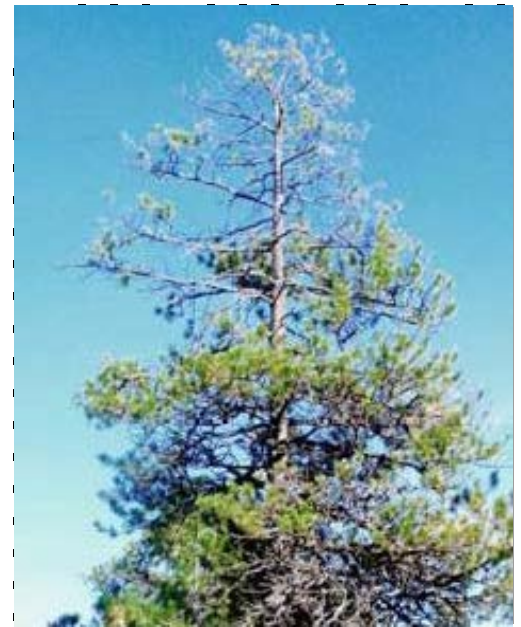
A ponderosa pine with advanced dwarf mistletoe infection. Note the heavy contorted "witch's brooms" in the lower branches. After long periods of infection, the needles at the top of the tree become sparse and shorter.

The tendency of mistletoe to infect all trees in a stand makes eradication difficult. No effective chemical treatment exists for mistletoe, and the only way to kill the parasite is to kill the host. In stands where only the susceptible species of tree exists, total eradication of the mistletoe would require a clear-cut, which is unacceptable to most landowners.