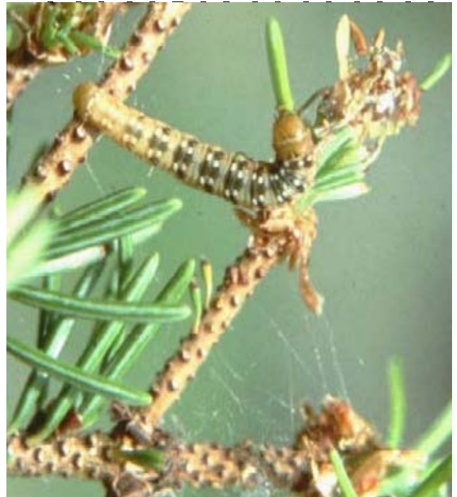
WSBW larva feeding on the needles of Douglas-fir. Note the typical webbing in the bottom of the photo.

Natural predators or severe winter weather helps control budworm populations, which keeps them at non-threatening levels. Spraying with Bacillus thuringiensis may be useful to protect high value trees, but is not practical on a large scale.