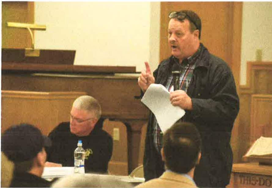
h and listened as > 20 on Tuesday . Making a