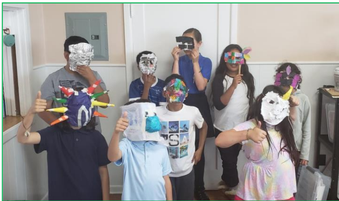
The kids of Atchison Village modeling the masks they made in the art class run by Richmond Art Center.