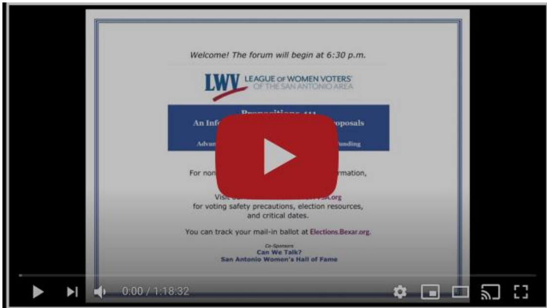
Propositions 411: An Informational Forum on Ballot Propositions