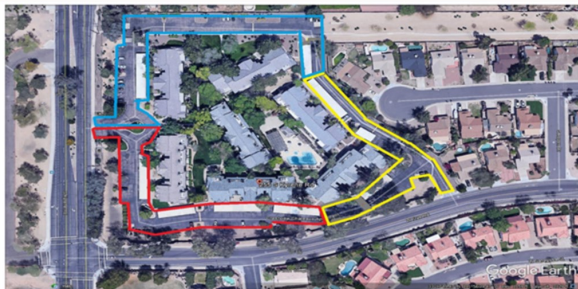
YELLOW (REVISED) - this section is closed 7am Tuesday 10/26 and is opened by 2pm Wednesday 10/27

When resumed, it's imperative that ALL vehicles are not in the designated areas by 7am on the day the work is to take place in order to avoid a $65.00 charge for moving any vehicles.