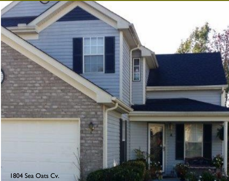
1804 Sea Oats Cv.